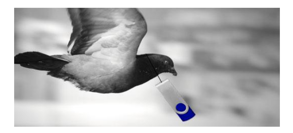
Figure 3. Conceptual image of the Carrier Pigeonic Sensing System http://www.switched.com/2009/09/11/pigeon-beats-isp-in-60-mile-race-to-deliver-data/